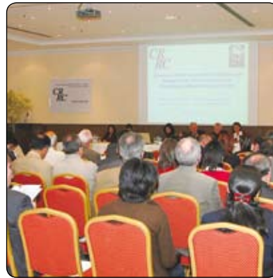
CRRC Armenia presents the results of the CRRC 2005 Data Initiative Survey. The event brought together researchers and professionals from NGOs, think tanks and government, and the media.

In the next few years, CRRC will expand the Data Initiative even further to ensure a more well-rounded view of the socio-economic situation in the South Caucasus. The data is now available on CRRC's websites for researchers throughout the world. To view or download the Data Initiative 2004 and 2005 databases, please visit the CRRC website at www.crrccenters.org . In every issue, Research Connections will highlight one interesting finding from CRRC's Data Initiative in the Data Initiative Spotlight.