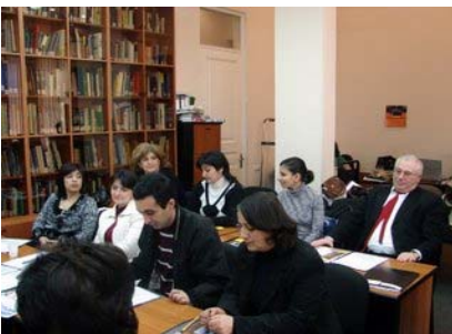
Journalists attend media training

On March 19-20, 2008 IREX's Core Media Support Program and USAID Armenia's Social Protection Systems Strengthening Project, in partnership with CRRC-Armenia , organized a training for journalists, principally from Armenian regions, entitled "Understanding and Reporting Labor Market Data."